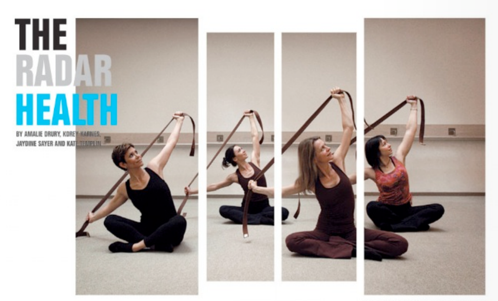
BODY BASICS: Students in a Core Fusion class at Exhale.